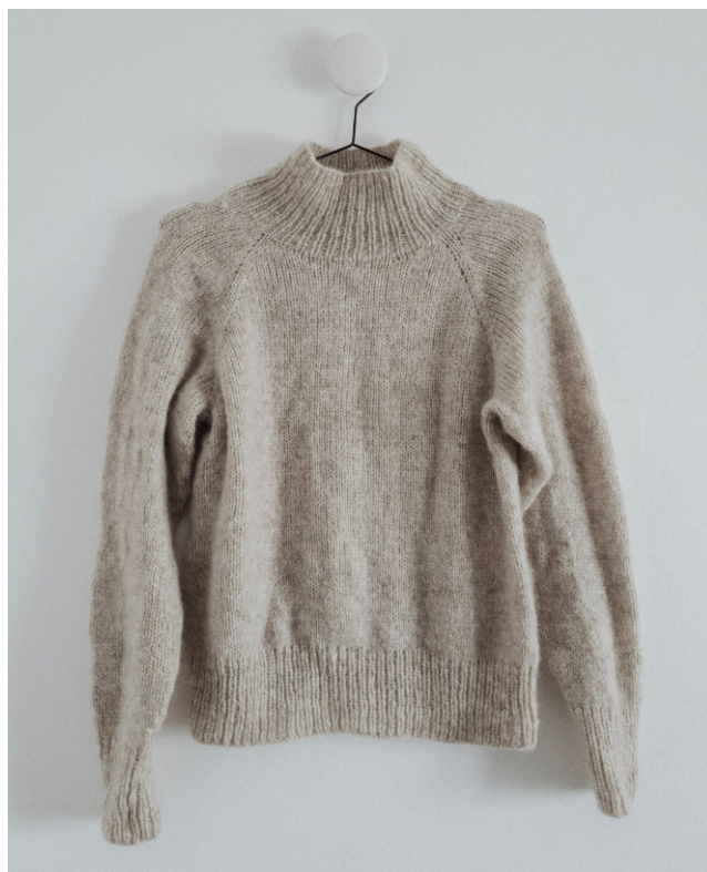
SAMPLE 2 (V1.0)