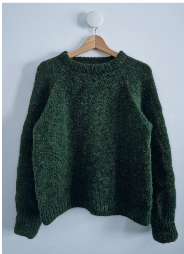
SAMPLE 4 (V2.0)