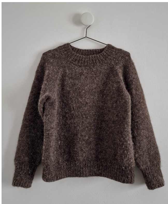
SAMPLE 1 (V1.0)