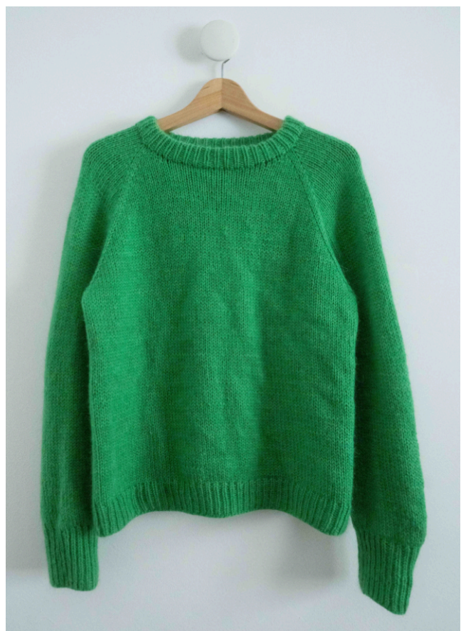
SAMPLE 3 (V2.0)